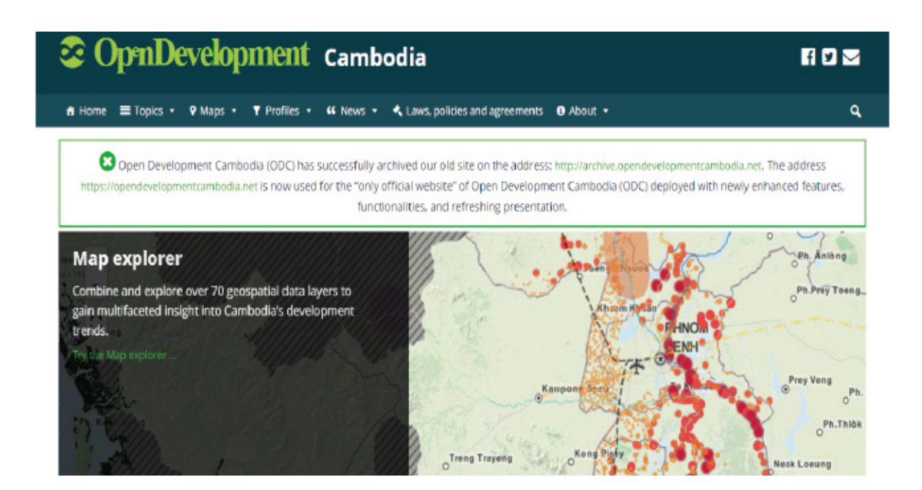
Figure 1. ODC's Open Data Portal

the information on topics like the quality of Cambodian governance, environmental policy and construction codes would not be possible without government data being made accessible.